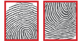
Placement variations on smaller sensors

The CBM's capture surface (14x22mm) ensures that the richest area on fingerprints is systematically captured time after time. Acquisition surface contributes significantly to the overall biometric performance: