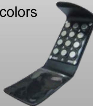
GA-12 - Numeric Event Wallet