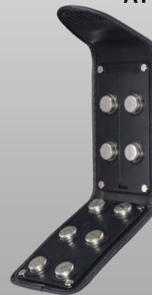
GA-02 - Event Wallet