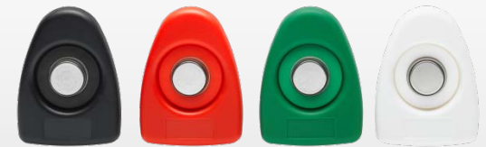
GA-01 - Location tag