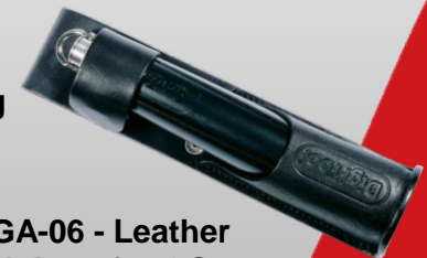
GA-06 - Leather Holster for GC-01