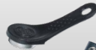
AT-32B - Key tag