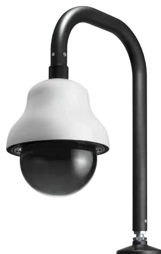
DBH24K0F022 + DBH05