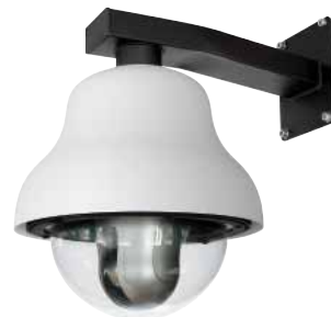
DBH24K (PANASONIC ADAPTOR) + DBH04