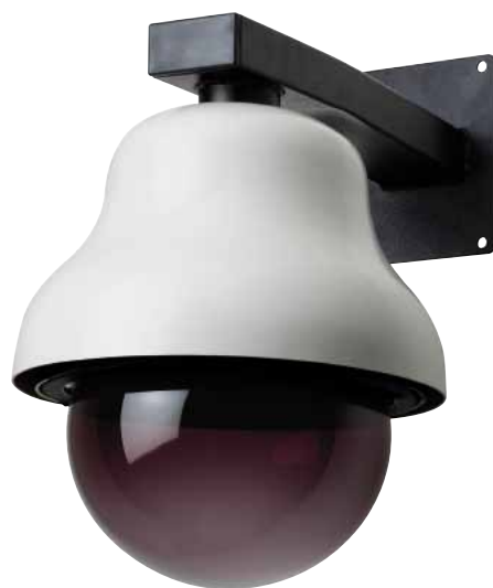
DBH24K + DBH04

The base model is supplied with internal adapters for various cameras, speed domes or network cameras and includes sunshield and fan-assisted heater.